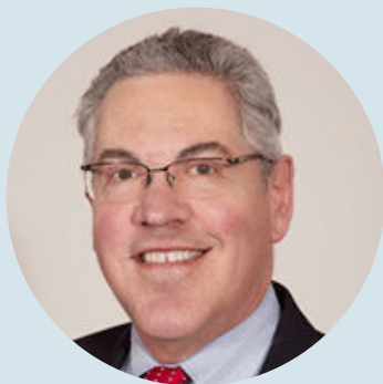
JACK ALAND PRESIDENT

Together, we are dedicated to uplifting and empowering communities worldwide, no matter what. We know that, thanks to your continued support, we're here for good.