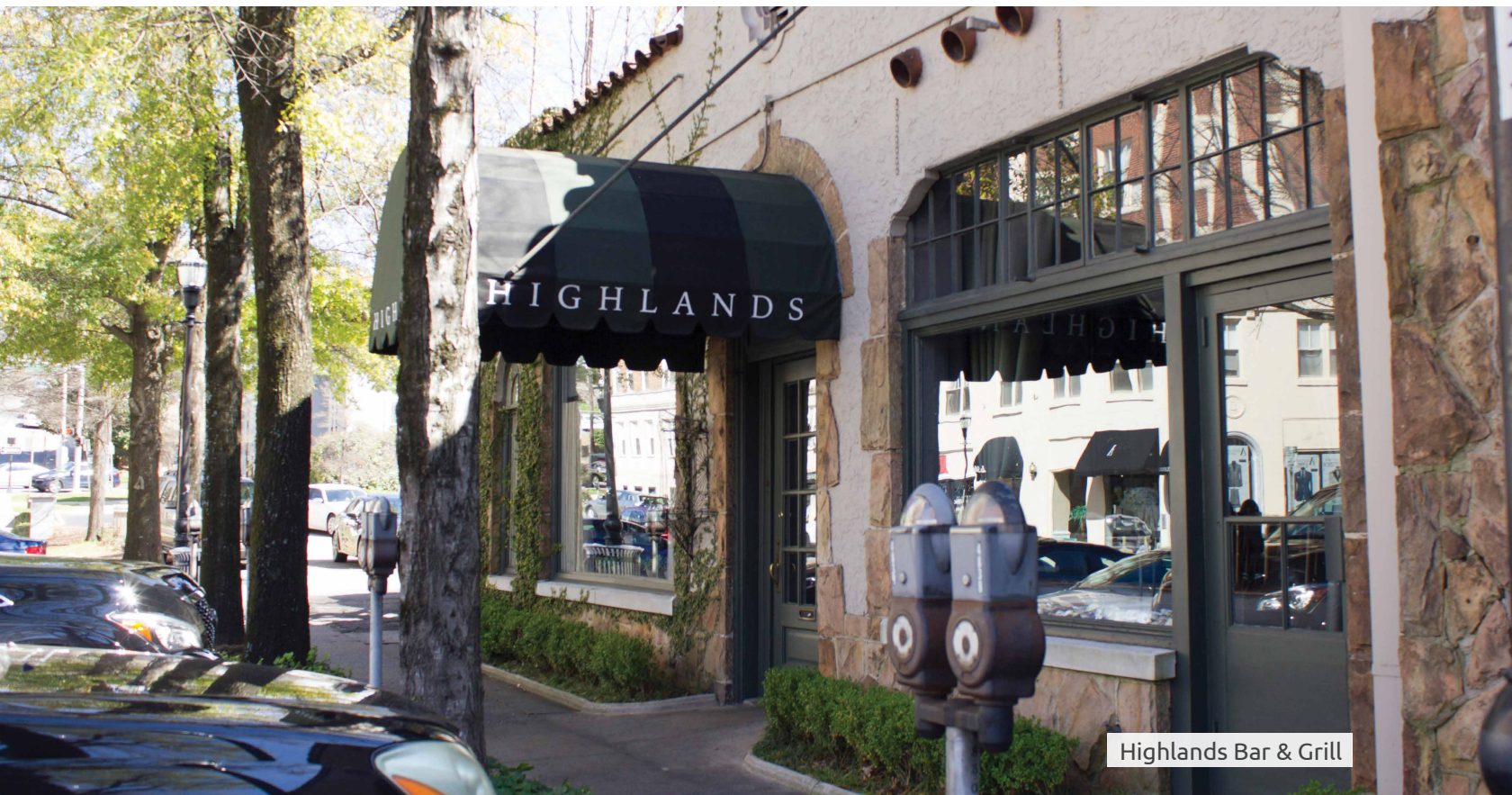
Highlands Bar & Grill