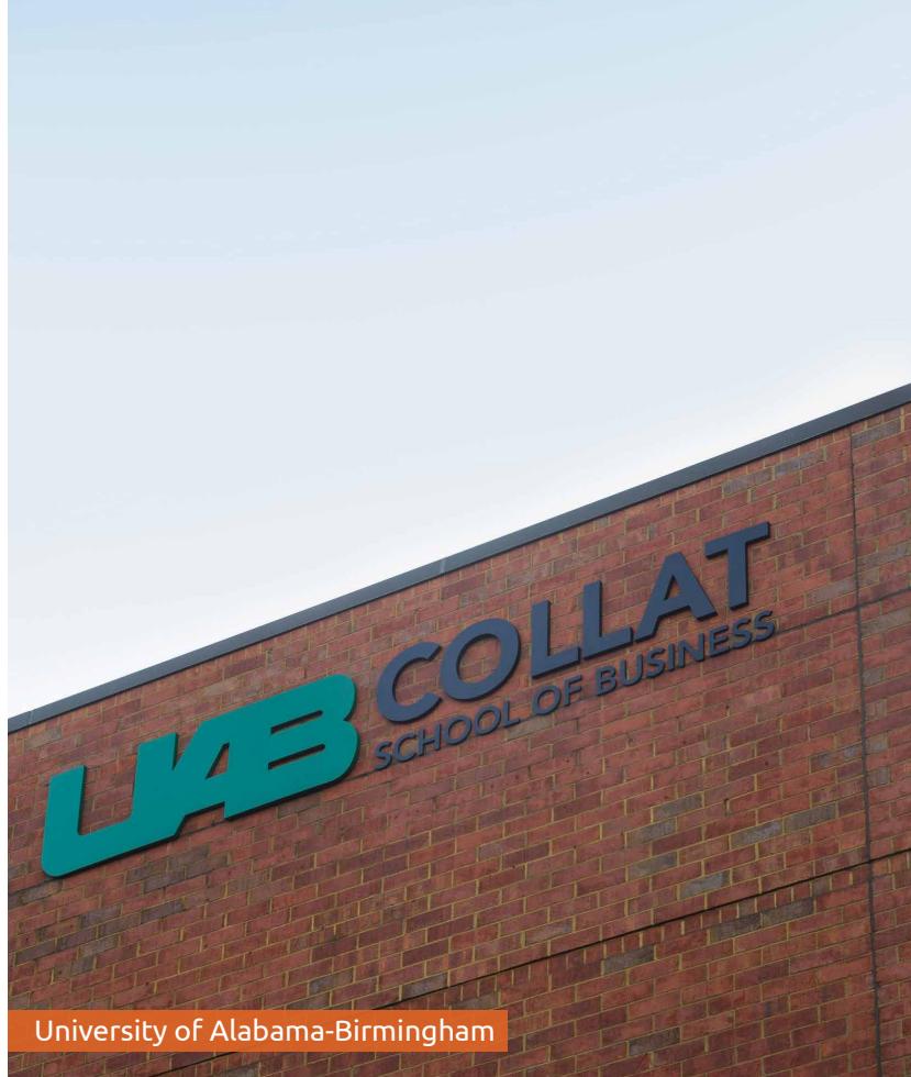
University of Alabama-Birmingham