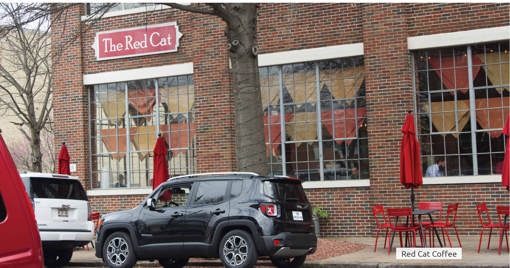
Red Cat Coffee