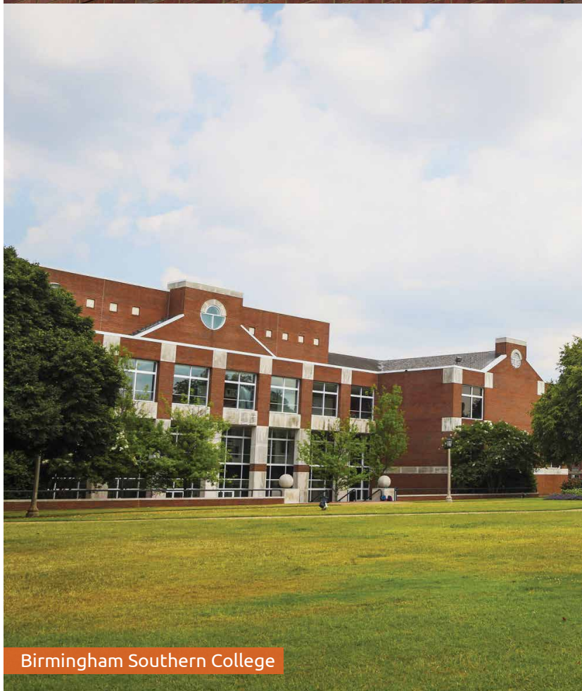
Birmingham Southern College